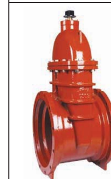
30" C509/C515 NRS Gate Valve (MjxMJ)

Design confirm to AWWA C509/C515 Connections confirm to C111/A21.11 Face to face confirm to ASME B16.10 Pressure Rating: Class 150/Class 250